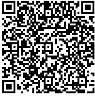
Dates for your diary

https://www.facebook.com/share/mFfgjiVG7PZNs3Gf/?mibextid=9l3rBW